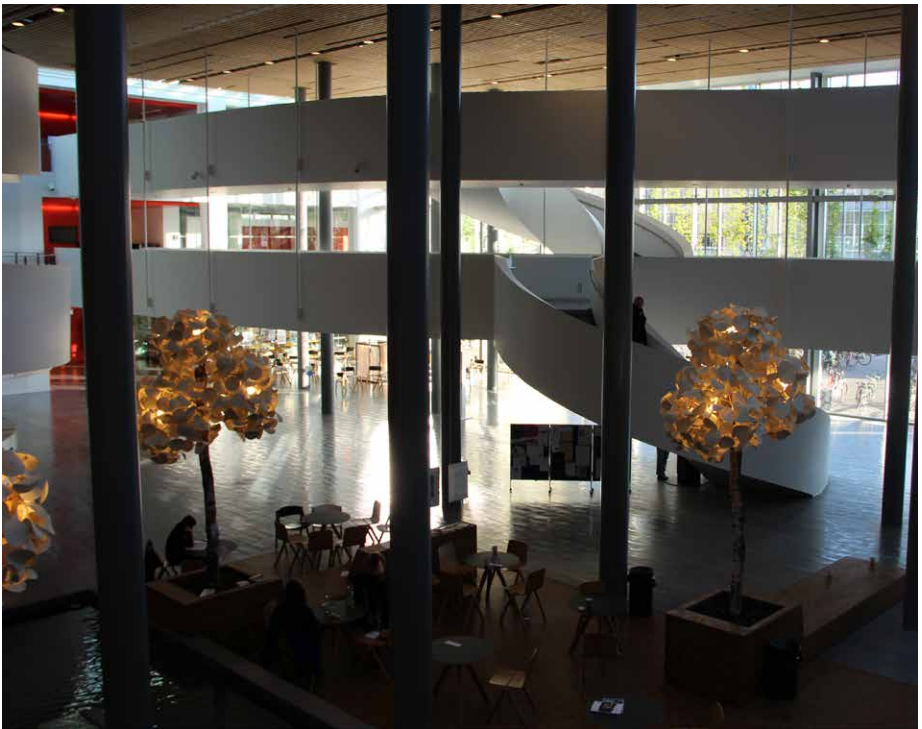
UNIVERSITY OF COPENHAGEN, SOUTH CAMPUS, BIG HALL, KUA2.